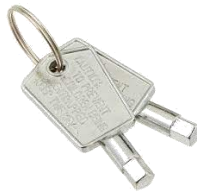
Keys x 2