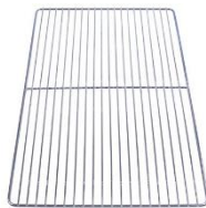
SHELVES x 3