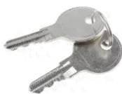
2 x KEYS